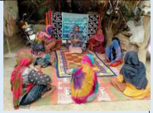
CRPs Training and community Sessions on COVID-19 at District Jacobabad