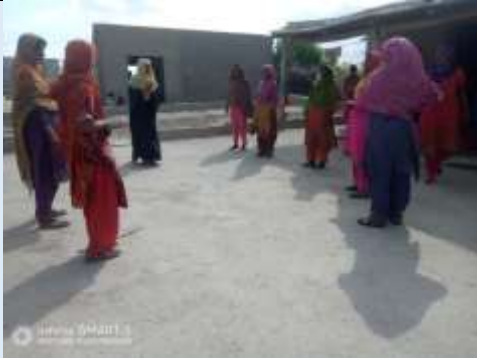
Social Distancing Session at Mirpurkhas