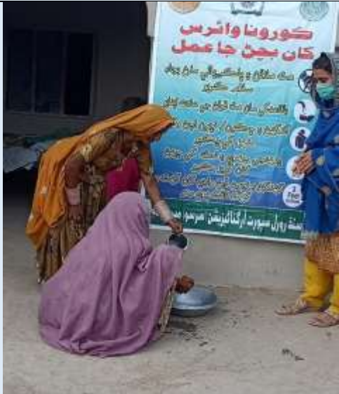
COVID-19 session on social-distancing at District Khairpur Mirs