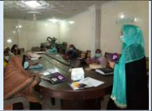
CRPs Training under DAFPAK Project at District Shikarpur

SRSO-District Larkana under Program for Improved Nutrition in Sindh media coverage of distributed "Personal Protective Equipment's" PPEs in below poverty households, Community Resource Persons CRPs and Agriculture Entrepreneurs AEs and soap among poor HHs.