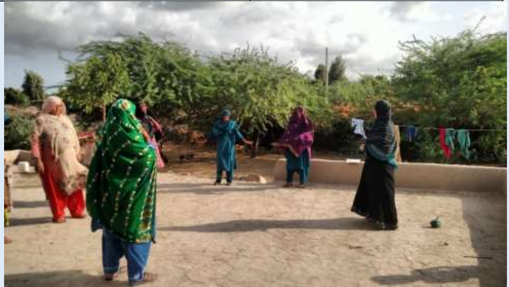
COVID-19 Hand-washing activity and social-distancing session at District Mirpurkhas