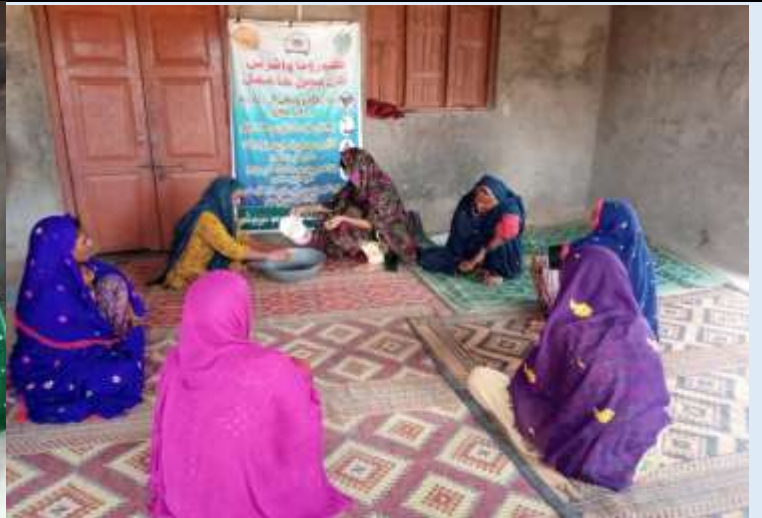
COVID-19 Community Awareness sessions at District Mirpurkhas