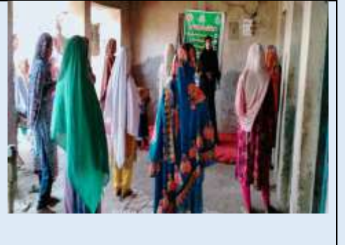
COVID_19 session at District Umerkot