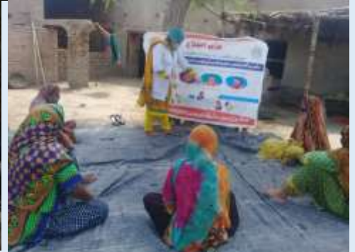
Community based awareness sessions on COVID-19 in District Shikarpur