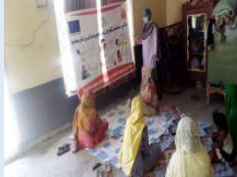
Communit6 Session at Shikarpur