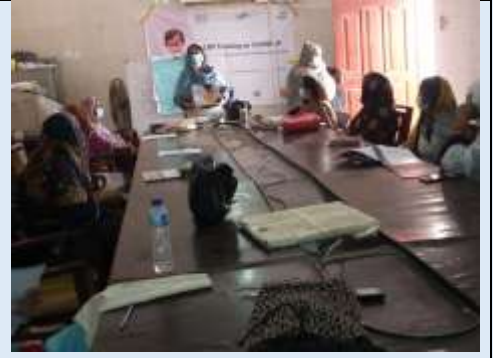
CRPs Training under DAFPAK Project at District Shikarpur